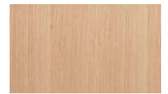
WH1 Natural (Oak Clear)

Incorporating botanical images into designs, expressing the cuteness of Scandinavian textiles.