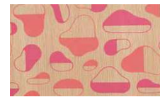
WLC Retro Pop

A pattern that expresses a rhythmic world. Light and gentle coloring according to the spatial image.