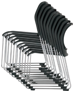
Stackable 10-High (Height 1090mm)