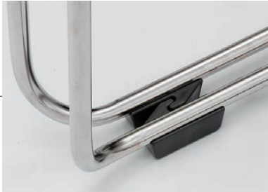
Ganging glides fitted as standard.