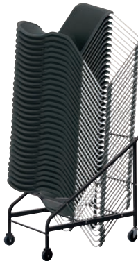
Stackable 30-High on dolly (Height 1990mm)