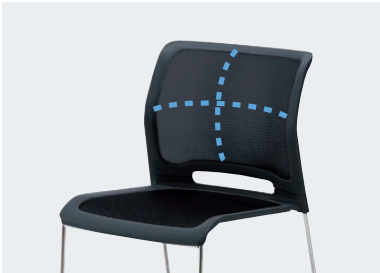
Ergonomically profiled 3D backrest with waterfall seat edge to support natural seating posture.

The 3D structural form based on ergonomics firmly supports the body and provides comfortable seating comfort.