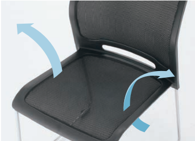
Integrated breathable tensile mesh disperses body weight for enhanced comfort suitable for longer period of use.