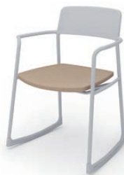
K13-ZZ11C - E2GH1K 1