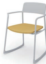
K13-ZZ11C - E2GH1S 1