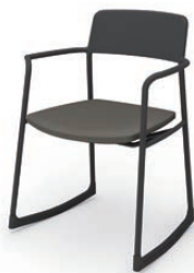
K13-ZZ11C - BKGHM6 1