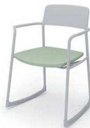
K13-ZZ11C - E2GH2J 1